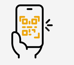
The client scans the QR code with Binance App